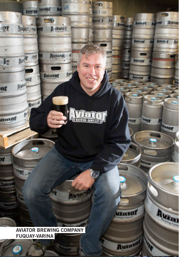
AVIATOR BREWING COMPANY FUQUAY-VARINA