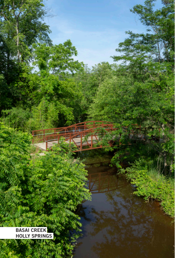
BASAI CREEK HOLLY SPRINGS