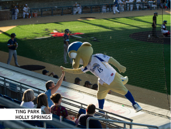
TING PARK HOLLY SPRINGS